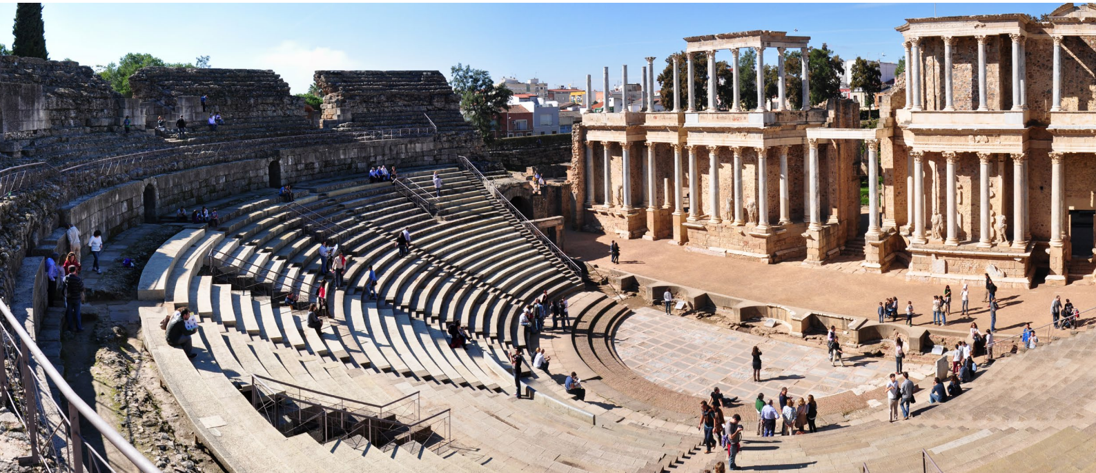
▲ ROMAN THEATRE, MÉRIDA