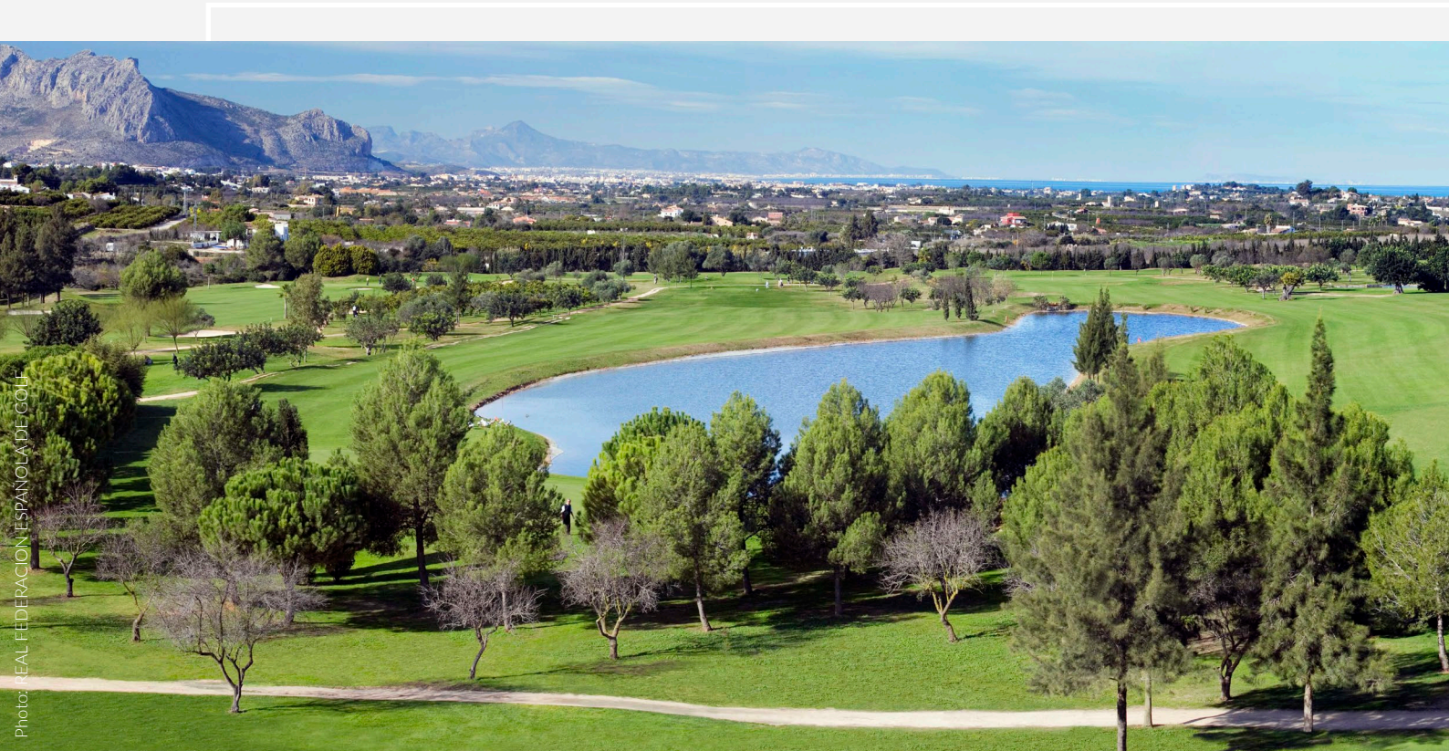
▲ SELLA GOLF RESORT &amp; SPA, DENIA

Along the Cantabrian coast, Green Spain, there are all kinds of golf courses. You'll also find Michelin-starred restaurants throughout Galicia, Cantabria, Asturias and the Basque Country. Just five minutes from the centre of Donostia-San Sebastián, in mountainous surroundings, the Real Nuevo Club Golf de San Sebastián Basozabal has one of the most demanding courses in the country. There is a restaurant with a terrace where you can try the exquisite local cuisine while enjoying magnificent panoramic views of the surrounding countryside. If it's haute cuisine you're looking for, then you really should try the Martín Berasategui, Akelarre and Arzak Restaurants, each one with three Michelin stars.