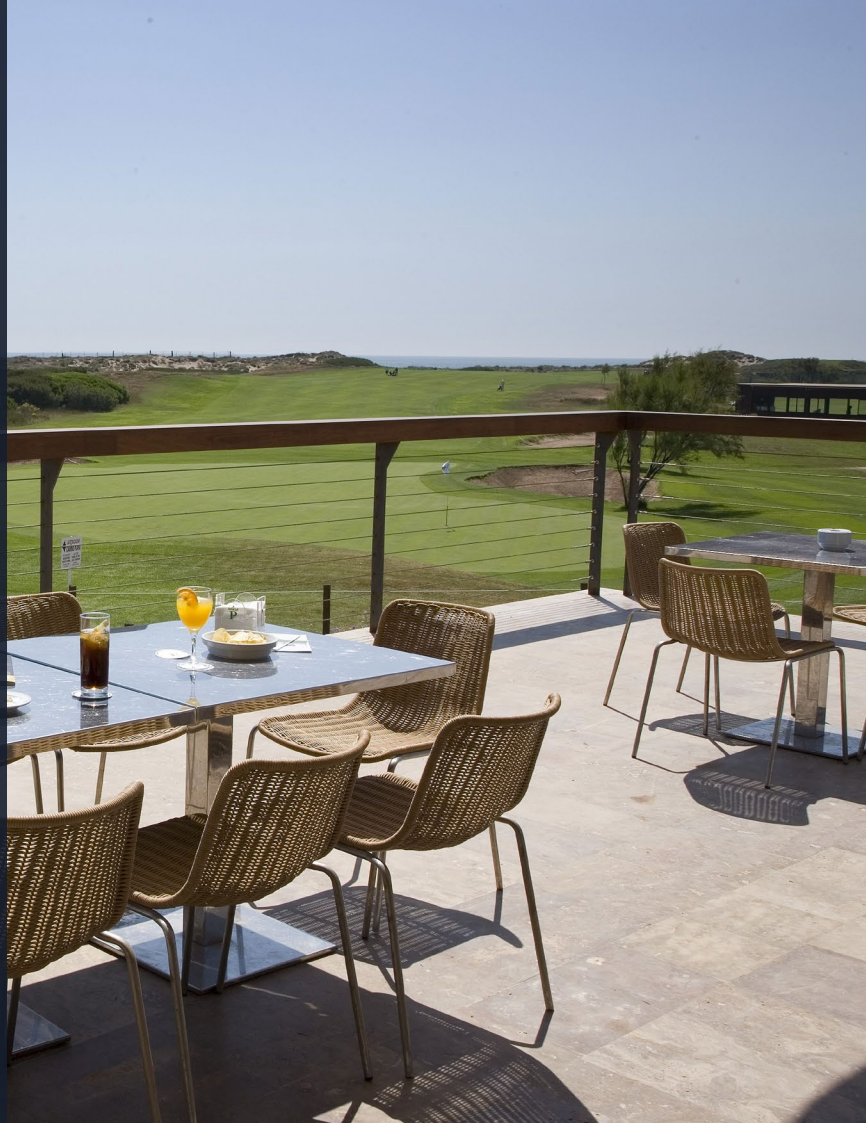
▲ EL SALER PARADOR HOTEL VALENCIA

Spain has an extensive network of Parador Hotels which are ideal for rest, relaxation and enjoying memorable experiences. They are located in delightful historical buildings which blend perfectly with their picturesque surroundings. The excellence of their cuisine and the variety of services are a guarantee of top quality and comfort for the traveller.