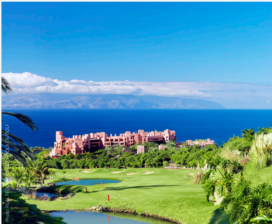
▲ ABAMA GOLF, GUÍA DE ISORA TENERIFE

We suggest you blend two passions, golf and good food. A fun and savoury way to discover our cuisine and new ways of improving your handicap .