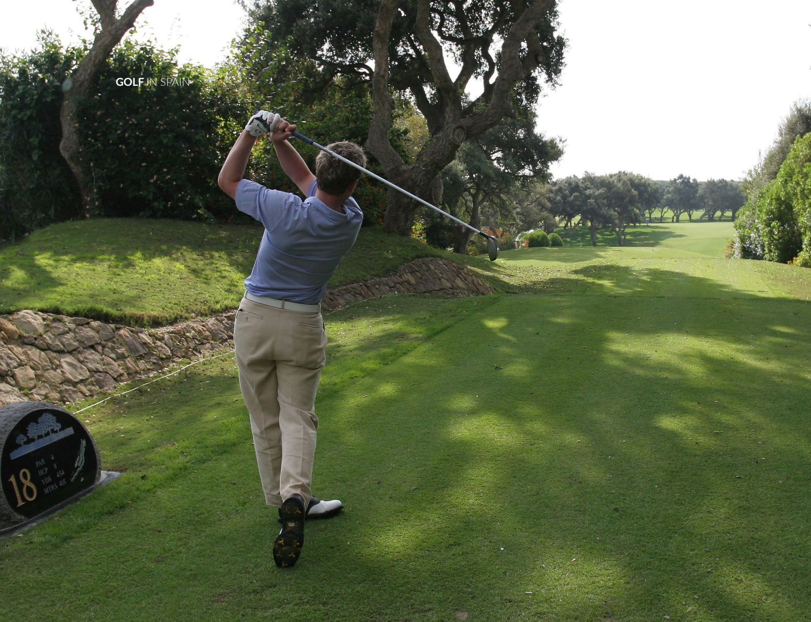
▲ REAL CLUB DE VALDERRAMA CÁDIZ