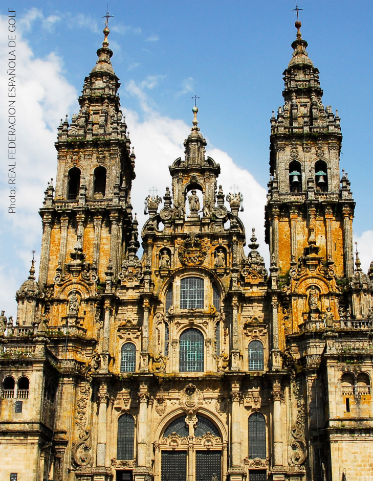
▲ SANTIAGO CATHEDRAL SANTIAGO DE COMPOSTELA