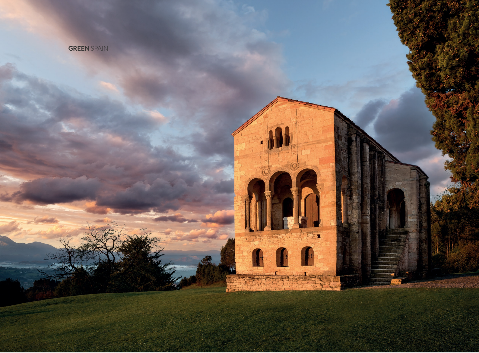
▲ SANTA MARÍA DEL NARANCO OVIEDO