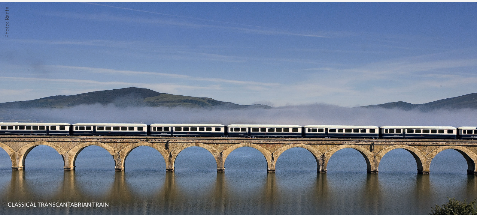
CLASSICAL TRASCANTABRIAN TRAIN