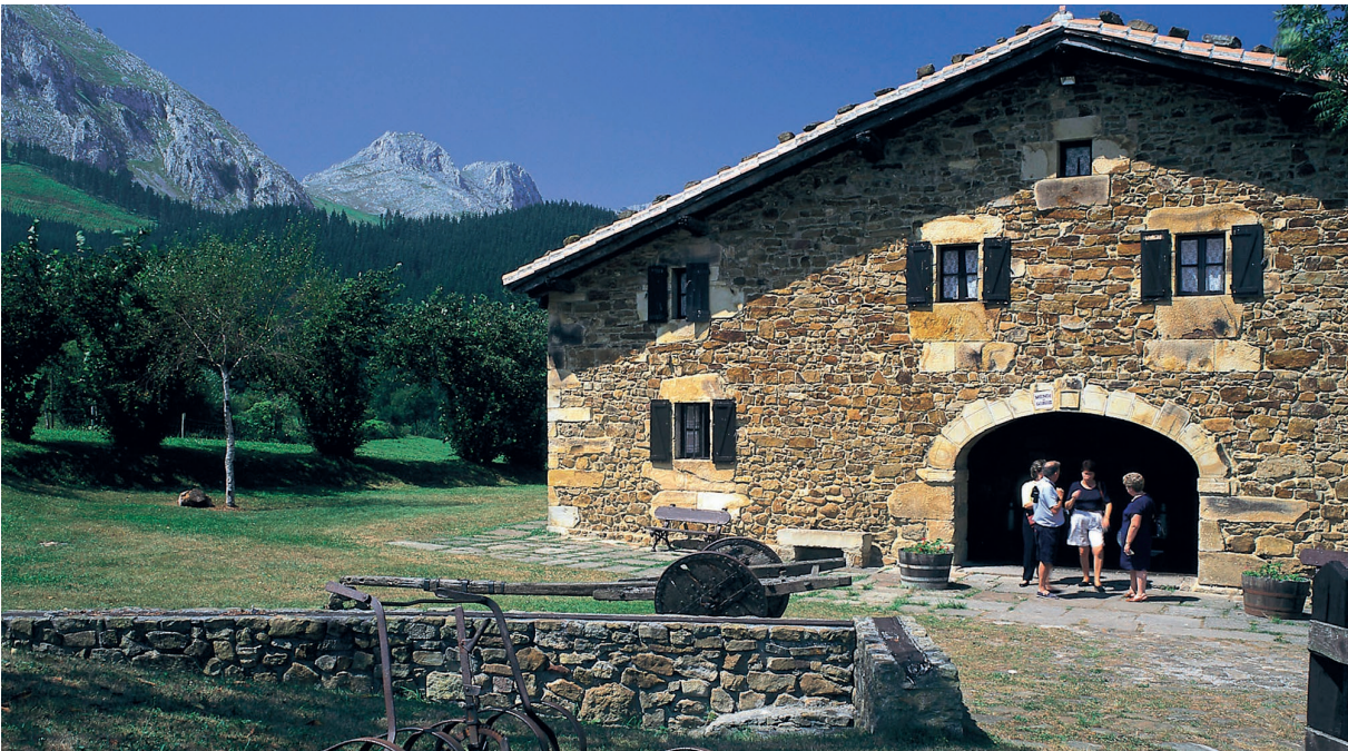
▲ RESTAURANT IN AXPE, GUIPUZCOA, EUSKADI