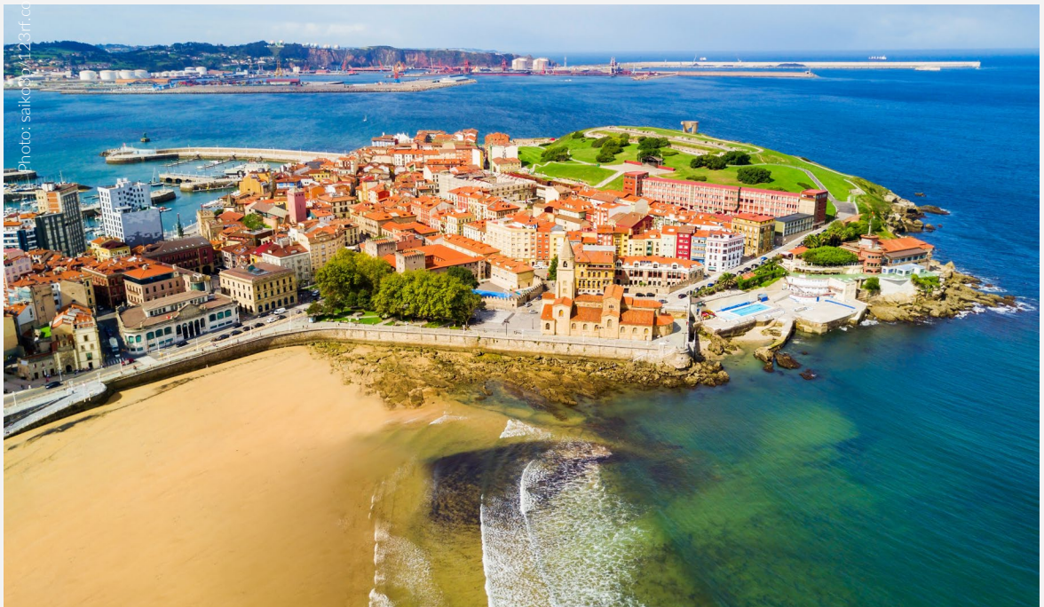
▲ PLAYA DE SAN LORENZO BEACH GIJÓN

If you're interested in history and architecture, there are some stunning palaces in Oviedo. From the Velarde Palace itself, which houses the museum, to the Palace of Camposagrado , an impressive 18th century mansion and the Palace of El Conde de Toreno , a Baroque gem.