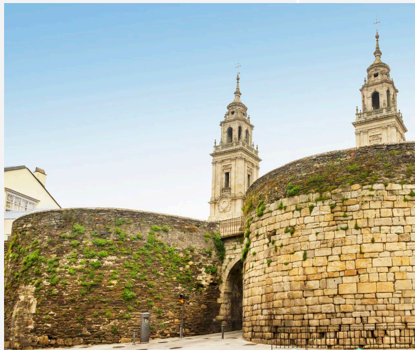
▲ CATHEDRAL AND ROMAN WALL LUGO