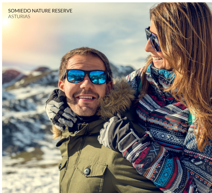
SOMIEDO NATURE RESERVE ASTURIAS