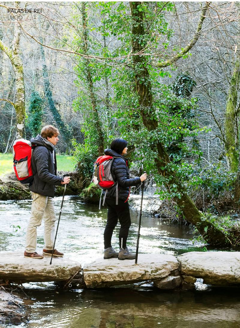
PALAS DE REI LUGO

This is the oldest of all the Ways that lead to Santiago. Follow a path trodden by pilgrims since the 9th century through the western interior of Asturias. Start in Oviedo , the capital of the Principality of Asturias . It is a lively city with an immense heritage. Travelling through the heart of Asturias, you will feel part of nature in the company of large rivers, steep gorges, waterfalls and ancient oak groves. Along the way you will come across towns like Salas , declared a Historic Site. You then pass through the municipalities of Allande and Grandas de Salime , where you'll find the Protected Landscape of the Sierras de Carondio and Valledor absolutely breathtaking. Now close to Galicia, you will have wonderful views of the Salime reservoir . Before joining the French Route, in Palas de Rei (Lugo Province), you will reach the top of the beautiful Alto del Acebo mountain, standing at over 1100 metres above sea level, and visit the imposing city of Lugo and its Roman Wall , which has been designated a World Heritage site. The route is studded with beautiful Galician villages for you to discover, such as Melide and Arzúa .