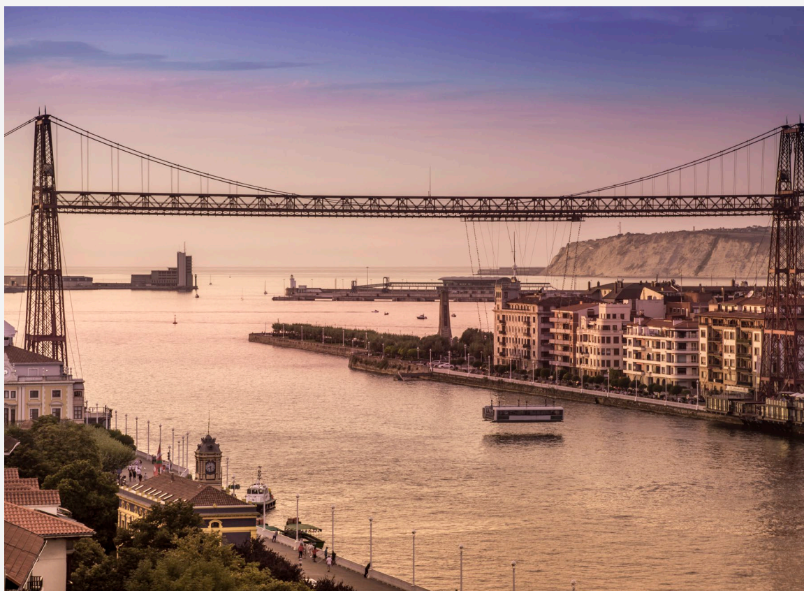
▲ BIZKAIA BRIDGE GETXO, VIZCAYA

Then you could take a bicycle and ride along the estuary to the old town. The route crosses the Nervión River over the Bizkaia Bridge , the first metal transporter bridge in the world, which has been designated as a World Heritage site by UNESCO. Once in the old town you can have a bite to eat in one of the lively restaurants and bars in the Siete Calles neighbourhood.