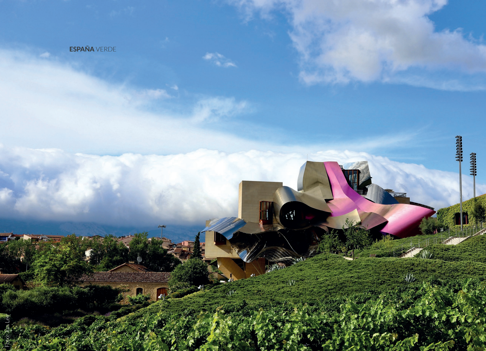
▲ MARQUÉS DE RISCAL WINE-CELLARS ELCIEGO, ÁLAVA