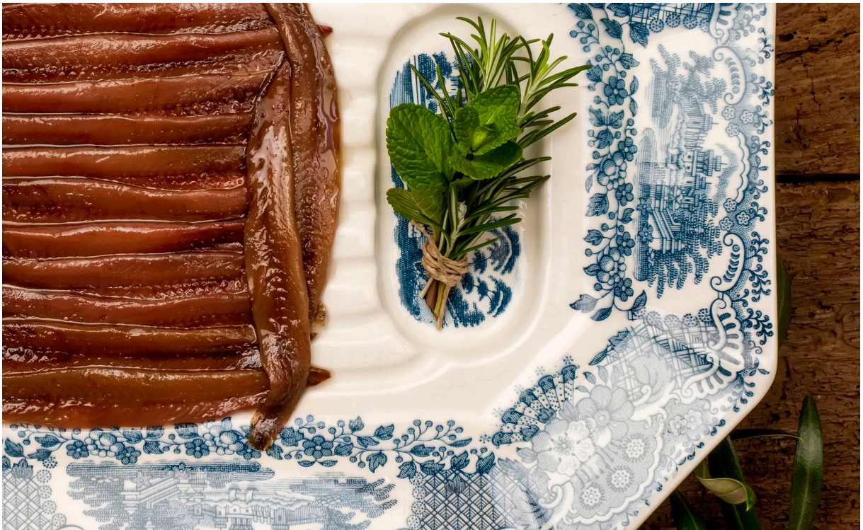
▲ SANTOÑA ANCHOVIES CANTABRIA