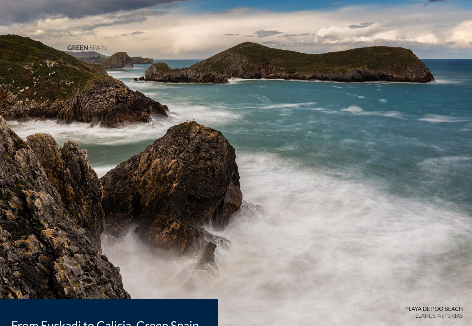
PLAYA DE POO BEACH LLANES, ASTURIAS

From Euskadi to Galicia, Green Spain is a succession of spectacular beaches.