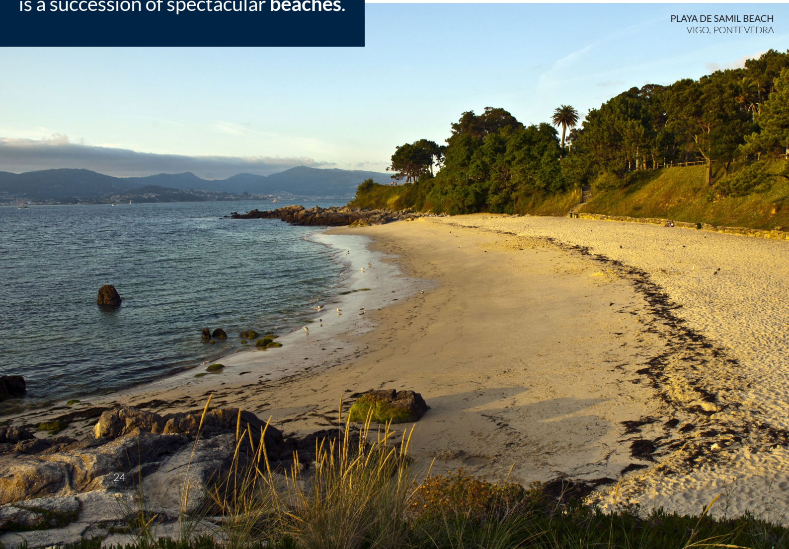
PLAYA DE SAMIL BEACH VIGO, PONTEVEDRA

From Euskadi to Galicia, Green Spain is a succession of spectacular beaches.