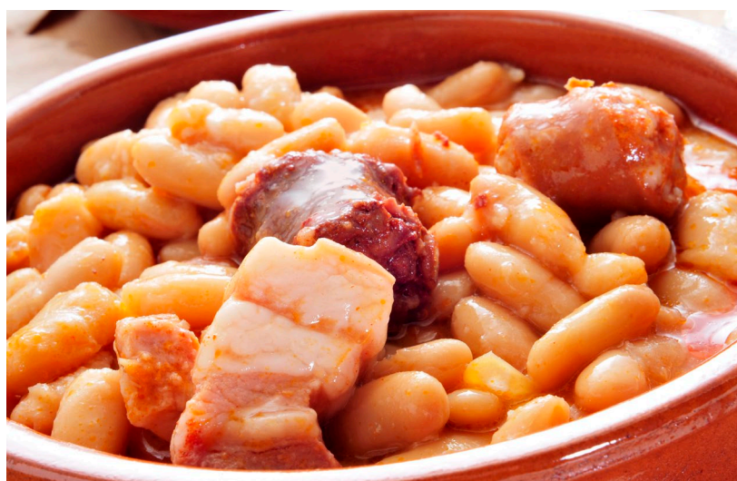
▲ "FABADA ASTURIANA" (BEAN AND PORK STEW)

Meat is best accompanied by strong red wines from the Rioja Alavesa region while seafood is best with the famous