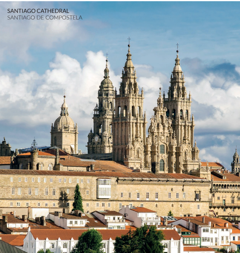
SANTIAGO CATHEDRAL SANTIAGO DE COMPOSTELA

This route also takes you to the Cathedral of Mondoñedo . You'll follow the medieval pathways through the little villages of Sobrado dos Monxes , with its famous monastery, and see natural treasures like the Sobrado lagoon . In the Monte do Gozo you can stay in the largest hostel in Spain and you can catch a glimpse of the towers of the Cathedral of Santiago de Compostela in the distance. You've reached the end of your journey!