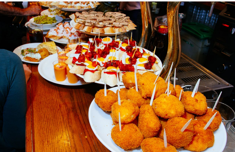
▲ PINTXOS SAN SEBASTIÁN

Here are some of the cities in Green Spain: surrounded by nature, full of spectacular monuments and with a vibrant cultural life.