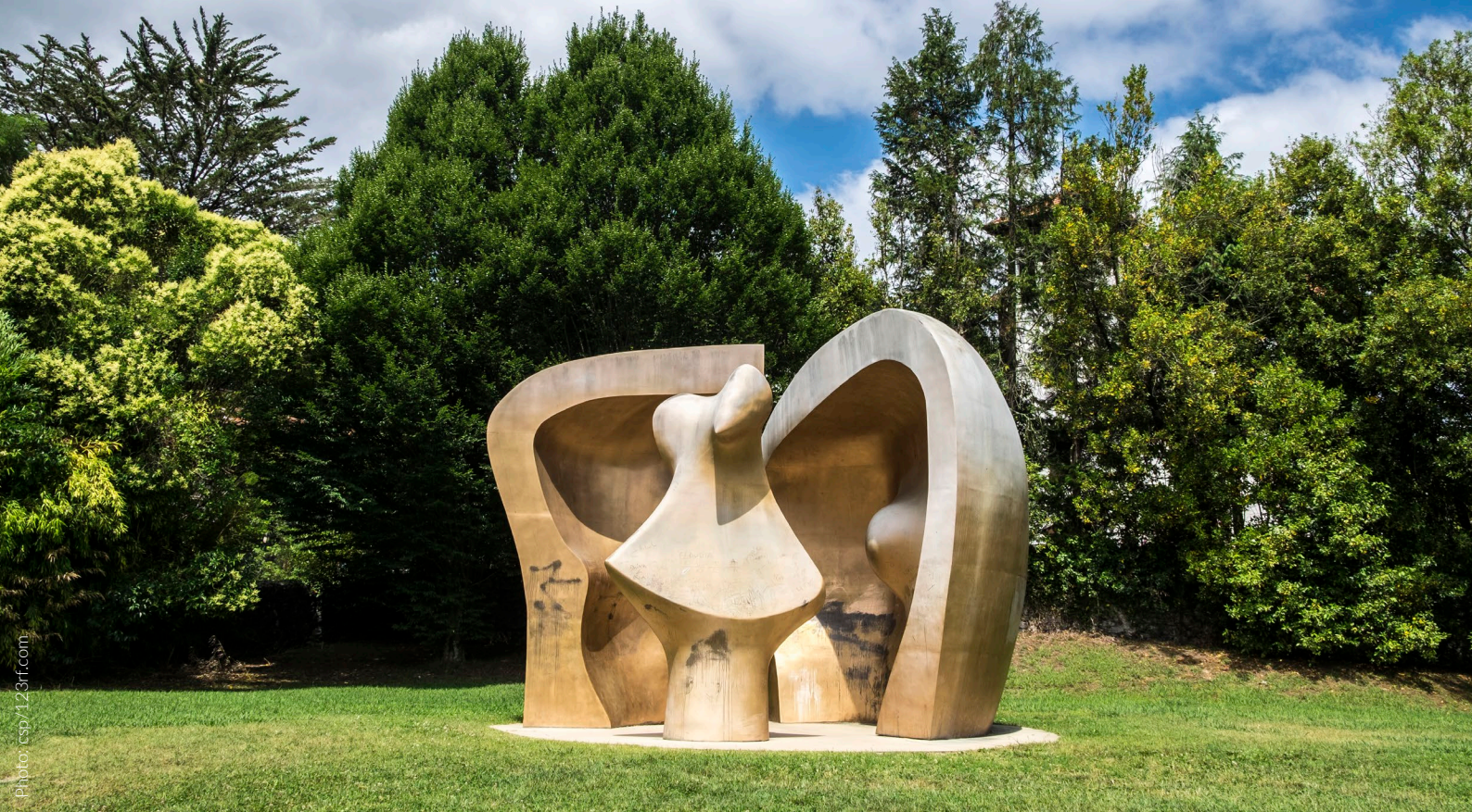
▲ EUROPEAN PEOPLES PARK GERNIKA, BIZKAIA

where you'll see surfers from all over the world. You'll also pass through Getaria , the birthplace of the famous fashion designer Balenciaga, where you can visit his museum. And finally Gernika , a symbolic town for all Basque people, bombed on the orders of Hitler by the German Airforce during the Spanish Civil War. This event inspired the iconic painting by Pablo Picasso that carries the town's name. The route also passes through less well-known areas and solitary valleys dotted with small villages where you'll be able to appreciate the friendliness of the local people.