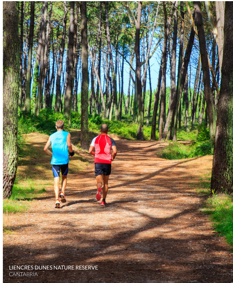
LIENRES DUNES NATURE RESERVE CANTABRIA

And there's still more to do in Galicia . You can visit the ACapelada mountains , home to the highest cliffs in Europe. Then there's the route of the Flysh with its impressive cliffs in the Basque Coast geopark , where you'll find the chapel of San Juan de Gaztelugatxe , a location you'll recognise from the Game of Thrones television series. The Basque Country is also home to the Urdaibai biosphere reserve , with its spectacular marshes teeming with life.