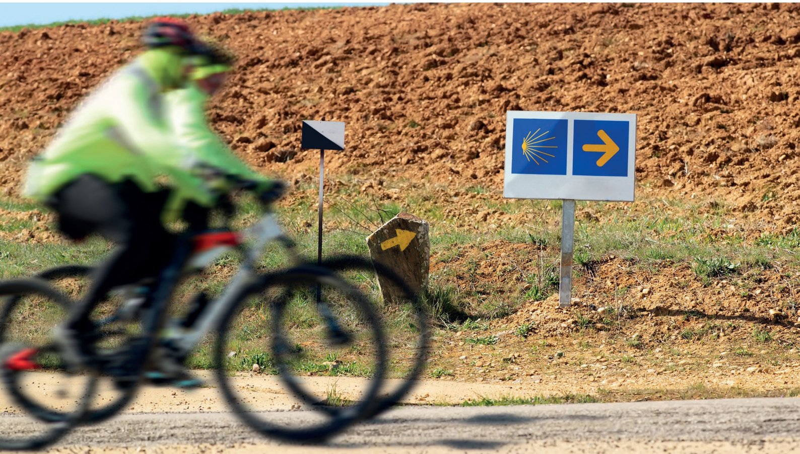
▲ THE WAY OF SAINT JAMES BY BIKE

Leave your routine behind you and travel across the north of Spain on foot or by bike or train along historic pathways. A journey which has transformed the lives of so many people and where you'll enjoy all kinds of unforgettable experiences.