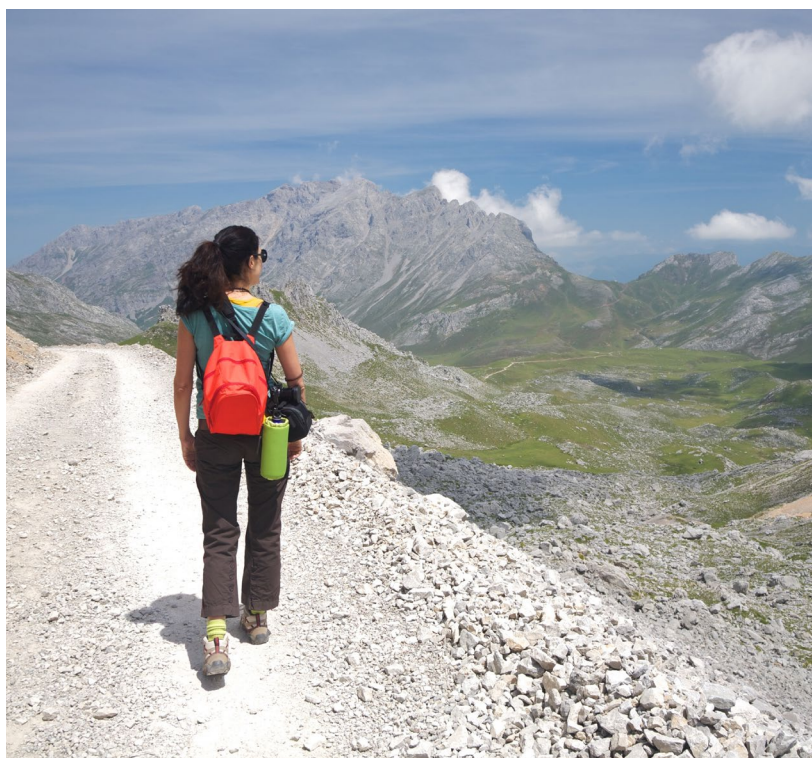
▲ PICOS DE EUROPA NATIONAL PARK CANTABRIA

The Picos de Europa National Park is a paradise of high-mountain trails and footpaths for all the family. Stroll through the forests in the Áliva mountain passes , or climb one of the most renowned peaks in Spain, the Naranjo de Bulnes in Asturias. You could hike the amazing Cares Gorge , or enjoy spectacular views from the